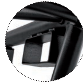
Forklift pick up points